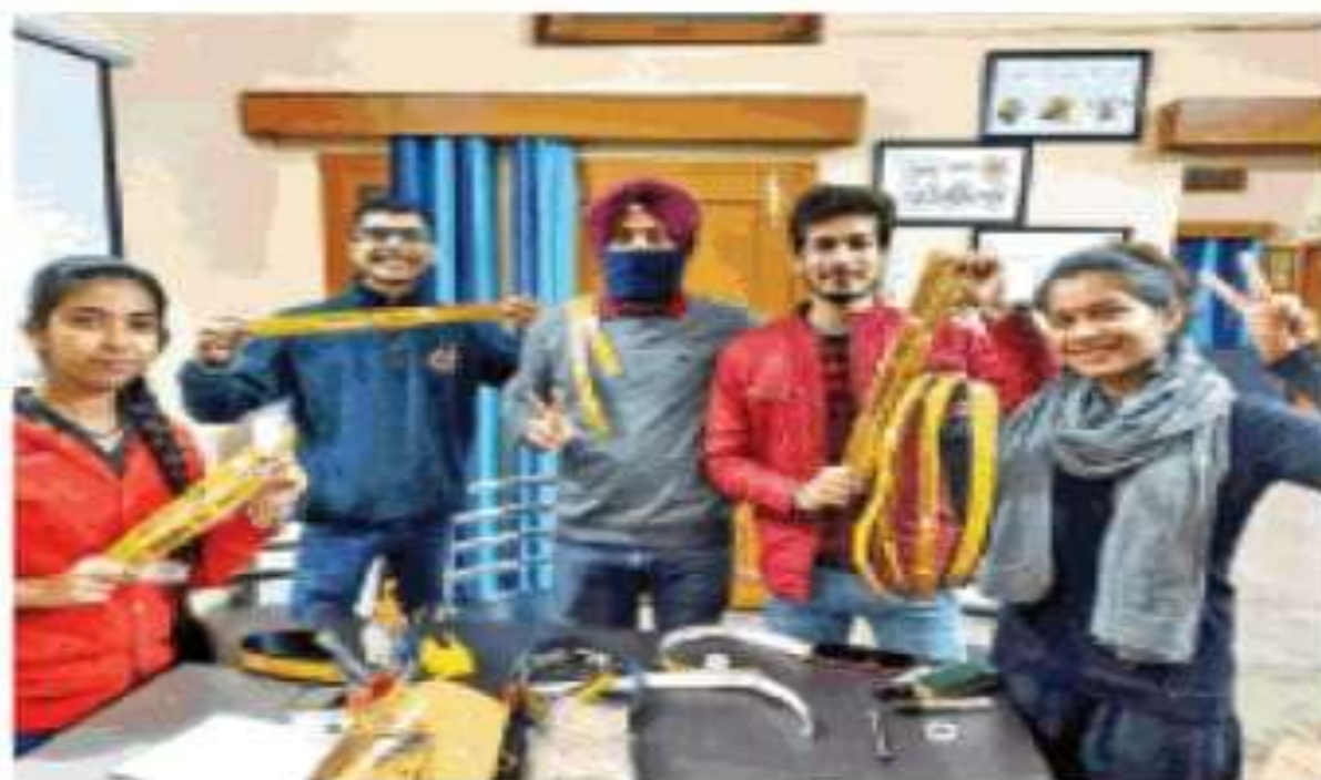
रिफ्लेक्टिव स्ट्रीप के साथ युवाओं की टोली

सर्दियों में रात को कोहरे के दौरान अक्सर वाहनों की टक्कर से सैकड़ों जानवरों की रोज मौत हो जाती है। 'स्वाहिश' के सदस्य दुर्घटनाओं में घायल जानवरों को प्राथमिक उपचार देने के लिए तत्पर रहते हैं। अभी तक 300 से ज्यादा जानवरों की मदद की जा चुकी है। 'स्वाहिश' की हेड