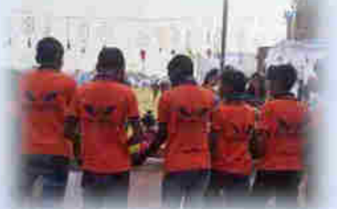
Chhauni children's academy during their annual sports meet.

When we encourage handmade crafts, we are not only contributing in uplifting a person, someone's family, small business, or economy but also making a beautiful place in the artist's heart.