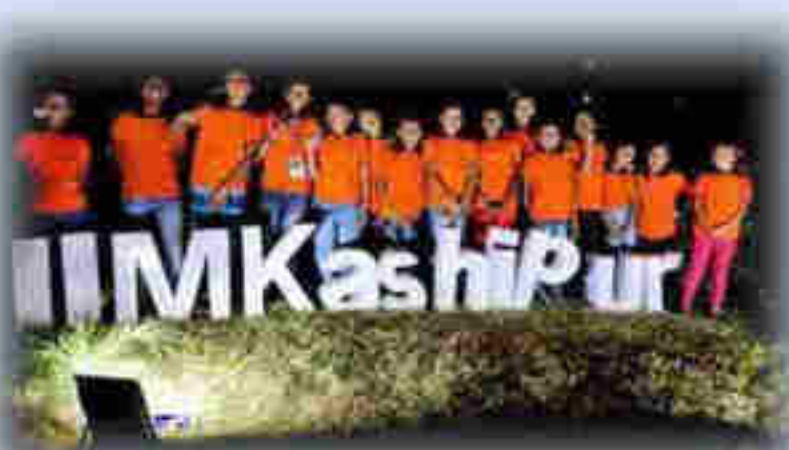
IIM kashipur during their Uthista Event