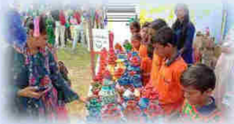
Ramleea Ground during Diwali Mela